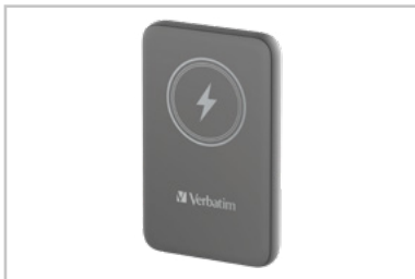
32249 - Front Angled