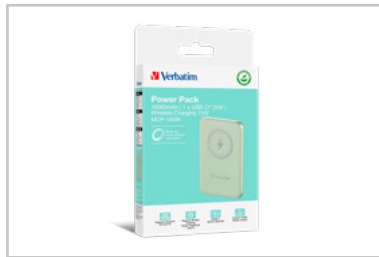
32246 - Packaging 3D