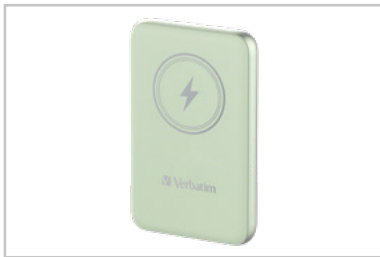
32246 - Front Angled