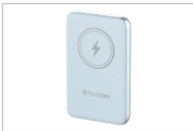
32247 - Front Angled