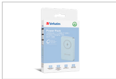
32247 - Packaging 3D