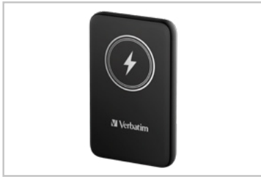
32245 - Front Angled