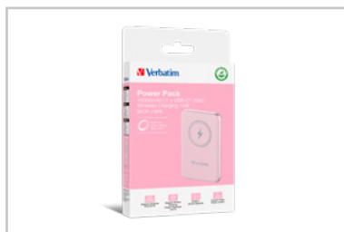
32248 - Packaging 3D