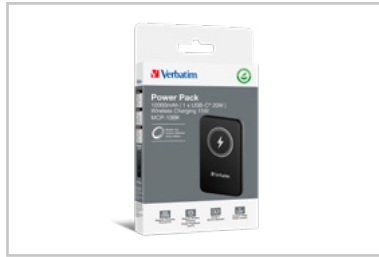
32245 - Packaging 3D