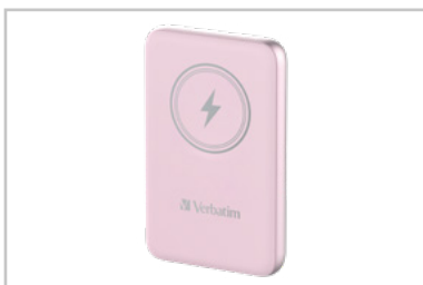
32248 - Front Angled