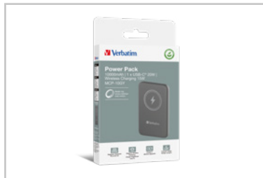
32249 - Packaging 3D